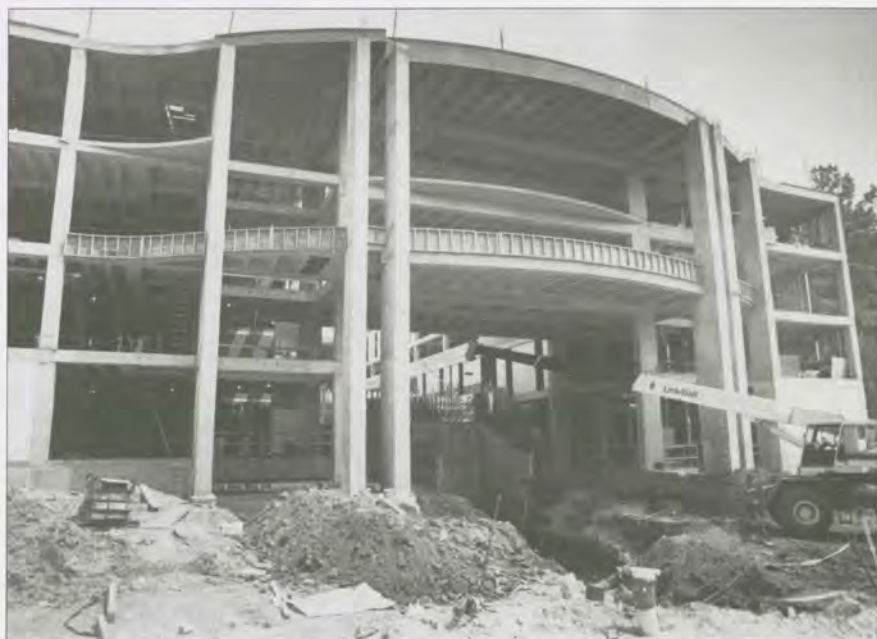
Construction on Phase 2 of the Law School.