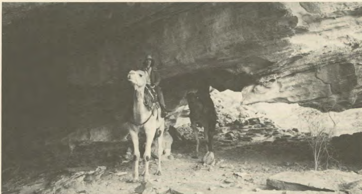
While in Australia, Professor DeMott took an eight day camel safari. Accompanied by two guides, a group of thirteen (all others Australian) mounted at the Camel Farm, which is an hour's drive south of Alice Springs. They rode to a base camp about 20 kilometers from the Farm, and, on subsequent days, took rides out into the desert.

All four faculty members benefitted greatly from the opportunity to conduct research in their respective fields and learn from their counterparts at the universities which helped sponsor their visits.