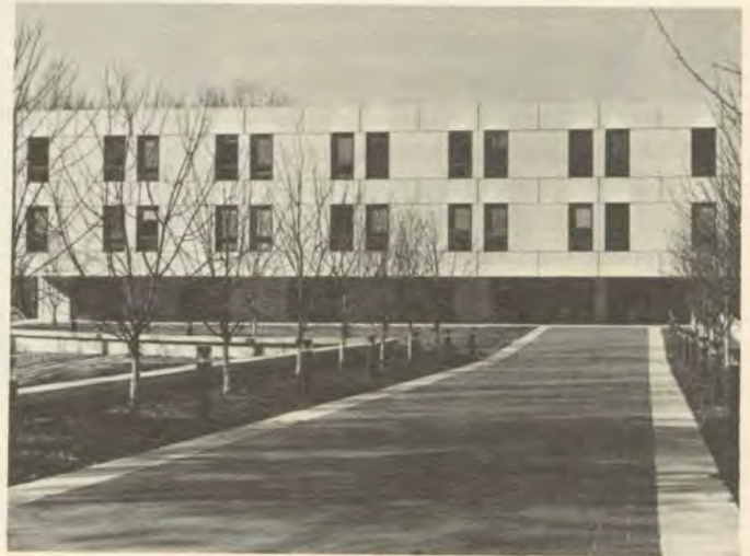
Fuqua School of Business