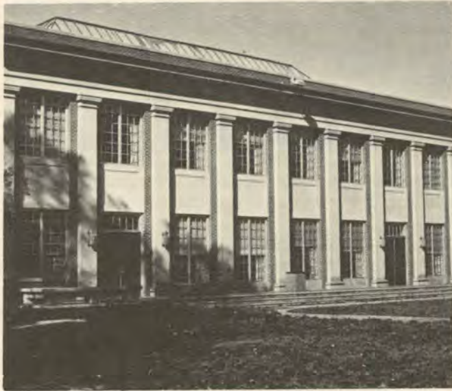
Duke University School of Law

company claimed Listerine was efficacious against the common cold.