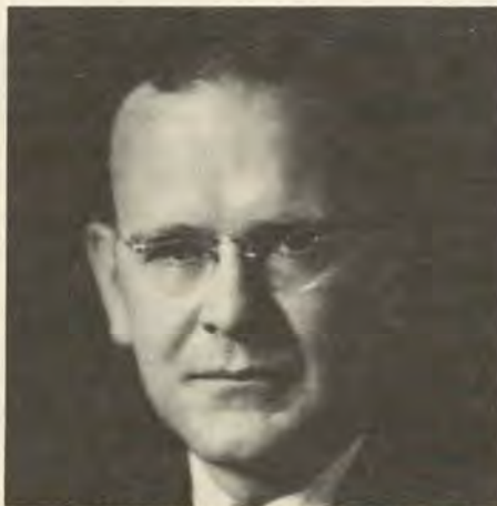
Lon Fuller

It was also at Duke that Fuller wrote one of his most famous essays in legal theory—entitled "American Legal Realism," 2 for which he won the Phillips Prize of the American Philosophical Society in 1935, and here that he laid the foundations for much of his later writing, including his best book in legal theory, called The Law in Quest of Itself , which he delivered as the Rosenthal Lectures at Northwestern in 1940 just as he was severing his ties with Duke. Fuller was much attracted to Duke