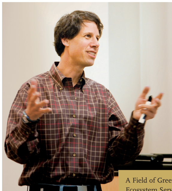
A Field of Green? The Past and Future of Ecosystem Services, 21 Journal of Land Use and Environmental Law 133-151 (2006), was reprinted as one of the best environmental law articles in 2006, in Land Use and Environmental Law Review .

The bill’s proposal to establish institutions that would facilitate ecosystem services