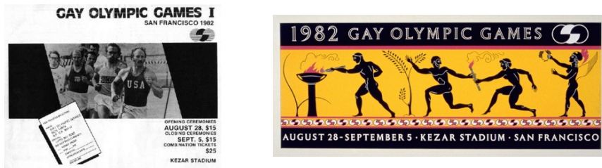
Poster and flyer from the Gay Olympic Games

Petitioner San Francisco Arts & Athletics, Inc. (SFAA), is a nonprofit California corporation. The SFAA originally sought to incorporate under the name “Golden Gate Olympic Association,” but was told by the California Department of Corporations that the word “Olympic” could not appear in a corporate title. After its incorporation in 1981, the SFAA nevertheless began to promote the “Gay Olympic Games,” using those words on its letterheads and mailings and in local newspapers. The games were to be a 9-day event to begin in August 1982, in San Francisco, California. The SFAA expected athletes from hundreds of cities in this country and from cities all over the world. . . . To cover the cost of the planned Games, the SFAA sold T-shirts, buttons, bumper stickers, and other merchandise bearing the title “Gay Olympic Games.” 2